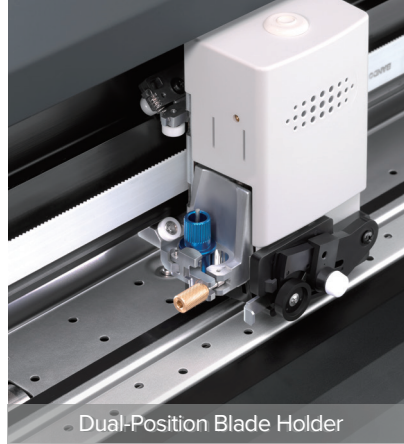
Dual-Position Blade Holder